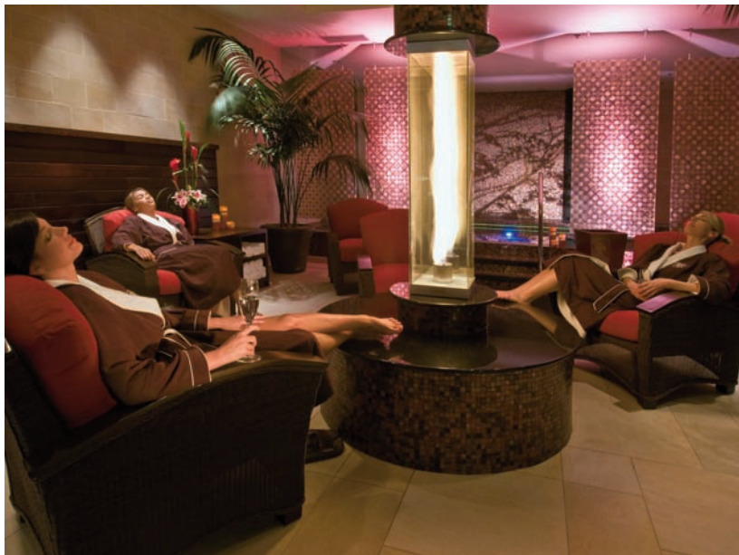
The Spa at the Battle House is a haven for pampering and relaxation. The Ladies Quiet Room is a refuge from the hustle and bustle of the holiday season. Consider giving a gift certificate to The Spa this year.

While studying the services, I mentally selected my dream spa day experience. This is what it looks like: the Signature Aromatic Warm Stone Massage, $150 for 80 minutes; the Signature Organic Facial, $95 for 50 minutes; the Hungarian Detoxifying Mud Wrap, $145 for 80 minutes and the Paraffin Treatment for Hands and Feet, $25. After that I would love some time in the Jacuzzi, followed by a manicure and pedicure and a cat-nap in the Ladies' Quiet Room. I would have to have some of the luscious products from the Spa Boutique, too. I think that would round out The Spa at the Battle House experience for me. What do you think?