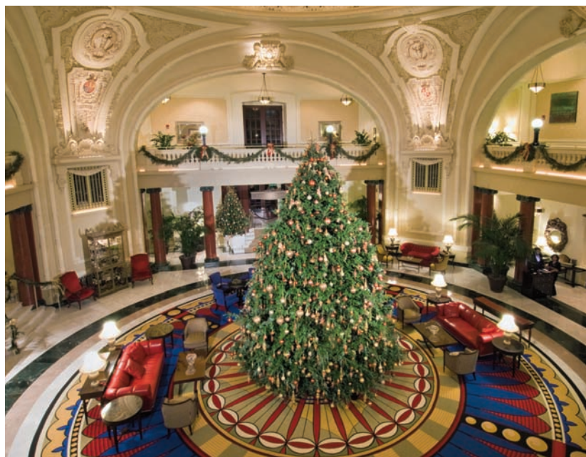
During the holiday season plan a visit to The Battle House Hotel. Have cocktails in the Royal Street Tavern or listen to live music in Joe Cain's. The Trellis Room will also be offering dining specials for Thanksgiving, Christmas and New Year's Eve.