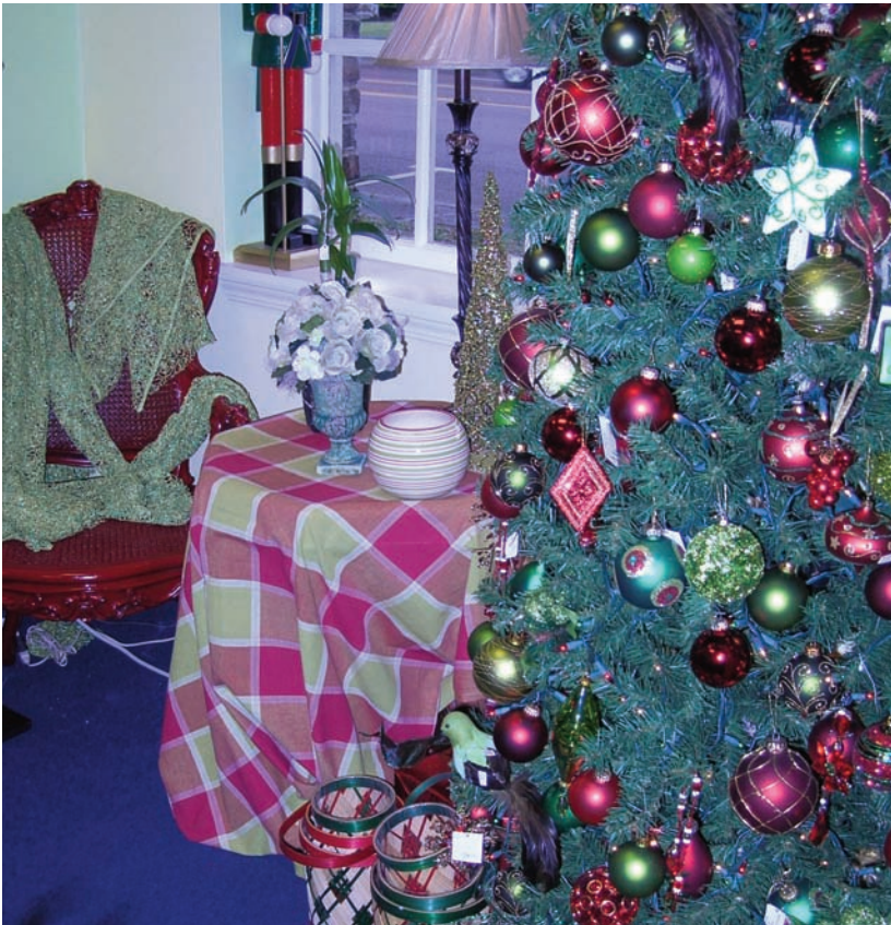
Bay Flowers is dressed for the holiday season. Don't forget to order poinsettias and holiday arrangements from this fun flower shop.

Demeranville Floral Company has moved to their new home on the ground floor of the AmSouth Building. This downtown Mobile institution still turns out some of the loveliest floral arrangements in town. I love the variety of live plants and the selection of poinsettias that Billy and his staff stock during the holidays. The best thing, you can stop in, pick up an arrangement and hand deliver it. They do deliver for those who like that convenience so, order now - 432-4667.