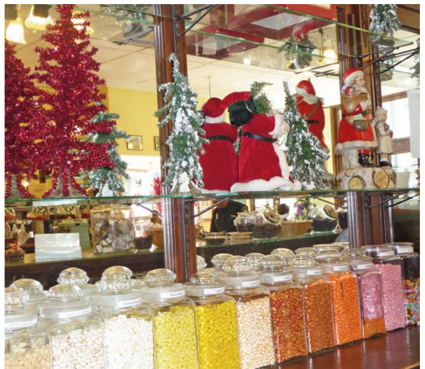
Three Georges makes holiday shipping easy by offering candy, cakes and nuts packaged and ready for shipping.

Three Georges will have a full shop of candy, cakes and pies -- some that will come pre-wrapped for easy gift-giving. I like to stock up on the small cellophane bags of candy to give to my friends' children. I think their cheese straws are the best in town and make the perfect hostess gift! I love giving and receiving them, too. And, we all know that a perfect Southern table is not complete without cheese straws on it.