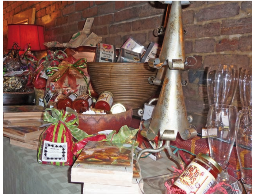
Inside Up is fully stocked with gifts for everyone on your list and offers free gift wrapping.