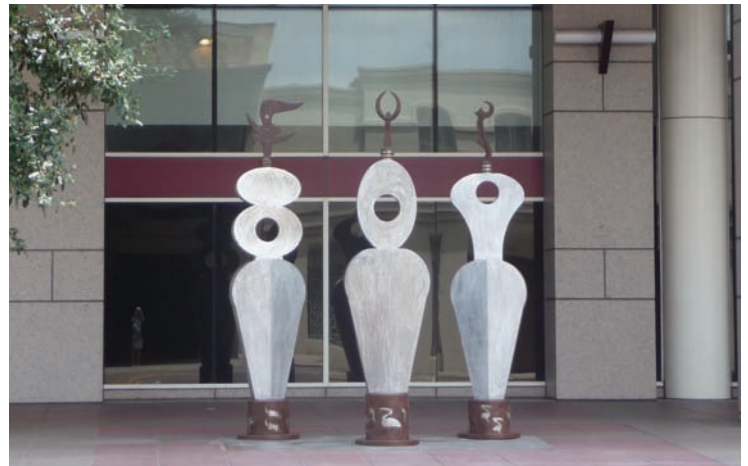
"Three Sisters" adds visual appeal to the expansive sidewalk in front of Government Plaza

experience in the story, but for him, the Three Sisters represent loyalty, prosperity and justice.