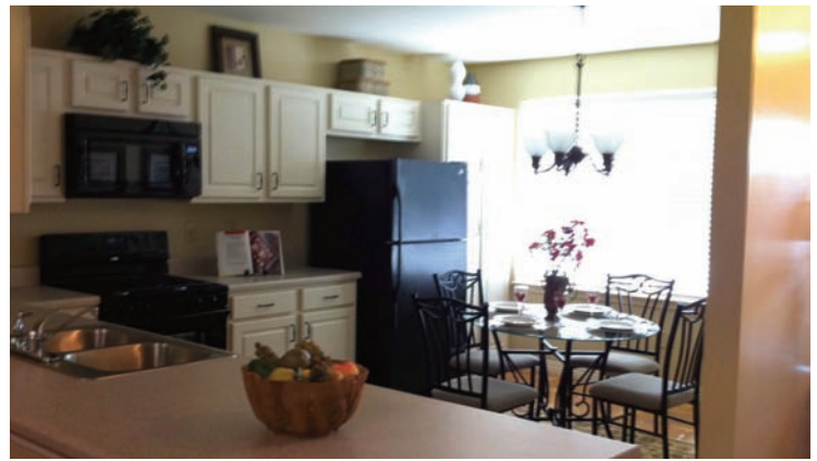
The spacious Renaissance units offer all the modern amenities

Both neighborhoods are Homeownership Catalyst Communities designed to help renters eventually become homeowners. Programs offered to residents include advice and classes about finance, wealth building and the path to homeownership. To qualify for one of these new homes you must be at least 19 years of age and be employed for at least one year or be enrolled in an approved educational curriculum. Residents must also meet income limit requirements. Monthly rent is calculated on a sliding scale based on family income. For more information, contact the Renaissance staff at 251-434-2302.