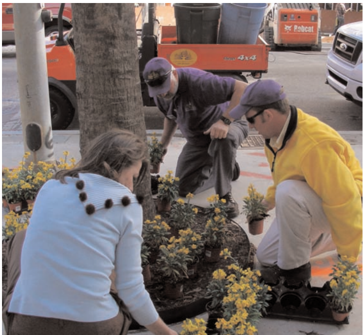
Stewards and Regents plant blooming annuals at the intersection of Royal and St. Francis Streets.

Regents are also gearing up for the potential 1-million visitors to downtown who may need assistance during Mardi Gras. They'll be doing every-