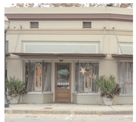
Planters in front of Tom Mason Communication on upper Dauphin Street add color and texture to the streetscape.