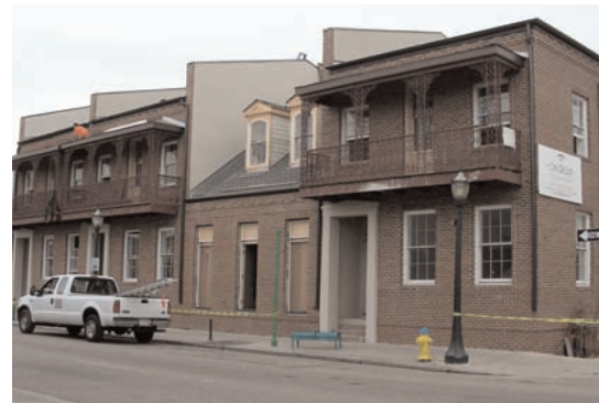
The new Clarkson Townhouses feature historic architecture with modern amenities.