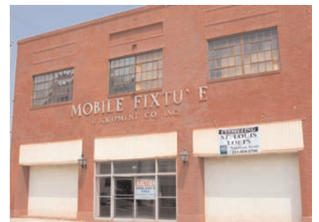
The former Mobile Fixture building covers most of a city block and will feature a variety of floor plans, all at least 1000 square feet and several as large as 1600 square feet.