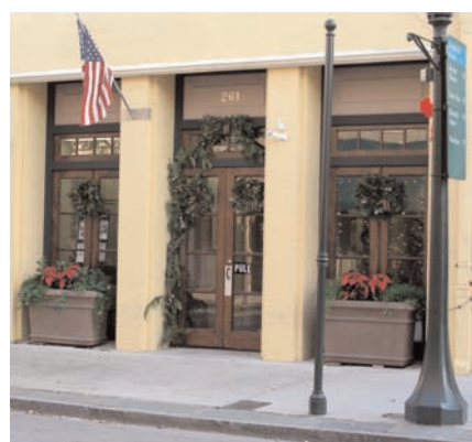
Sidewalk planters can have a dramatic impact on the pedestrian experience in downtown.