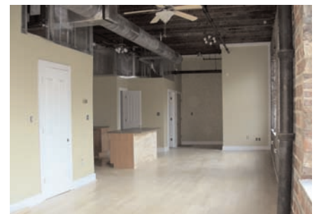
All of the units of St. Emanuel Place are lofts or "soft" lofts, which means some walls have been added to the open floor plan.