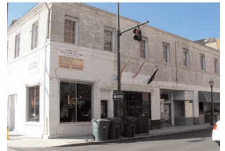
The O'Gwyn Building will anchor the corner of Conception and Conti Streets with 12 condo units.