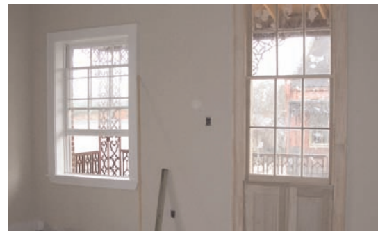
An upstairs bedroom of the Clarkson Townhouses features a balcony overlooking Dauphin Street