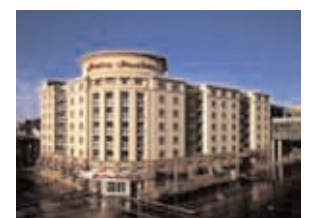
The downtown Mobile Hampton Inn will have a design similar to this Hampton Inn in Memphis, Tenn. Both properties are developed by Cowart Hospitality Services.

"We are looking forward to the opening of the hotel; the Edmonds will run a good operation in a well-designed hotel. It is a good investment. We have a lot of anticipation surrounding this project," stressed Cowart. "This is not a roll of the dice, but an actual happening."