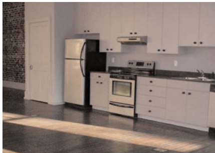
The second floor of the old Franklin Firehouse features wide-open living space and a gourmet kitchen.