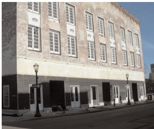
The old Mattress Factory on Dauphin Street will be converted to 25 condominium units