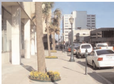
Before (above left) and after planting at the intersection of Royal and St. Francis Streets.

Our team of "purple and gold" is certainly making downtown Mobile the kind of beautiful and welcoming neighborhood we all desire!